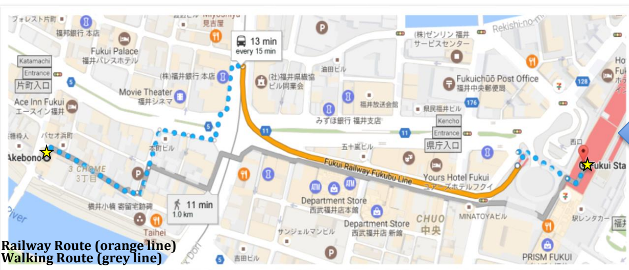
Railway Route (orange line) Walking Route (grey line)