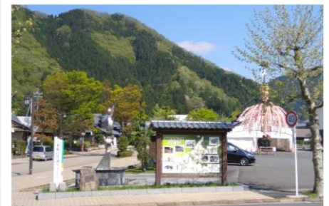
Photo of Washi no sato stop

From Washi no Sato bus-stop to Otaki Shrine